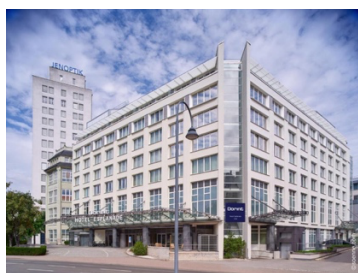
Dorint Hotel Carl-Zeiss-Platz 4 07743 Jena