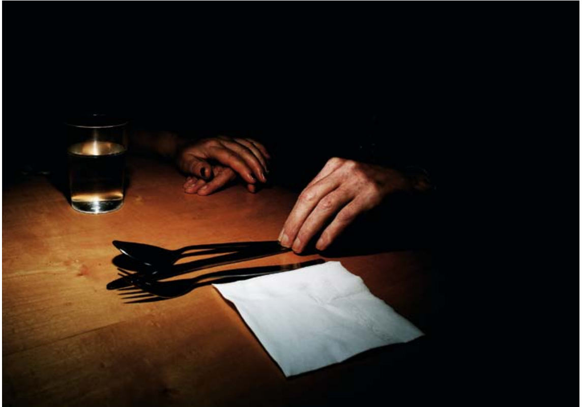
Manuel Capurso Untitled, 2007