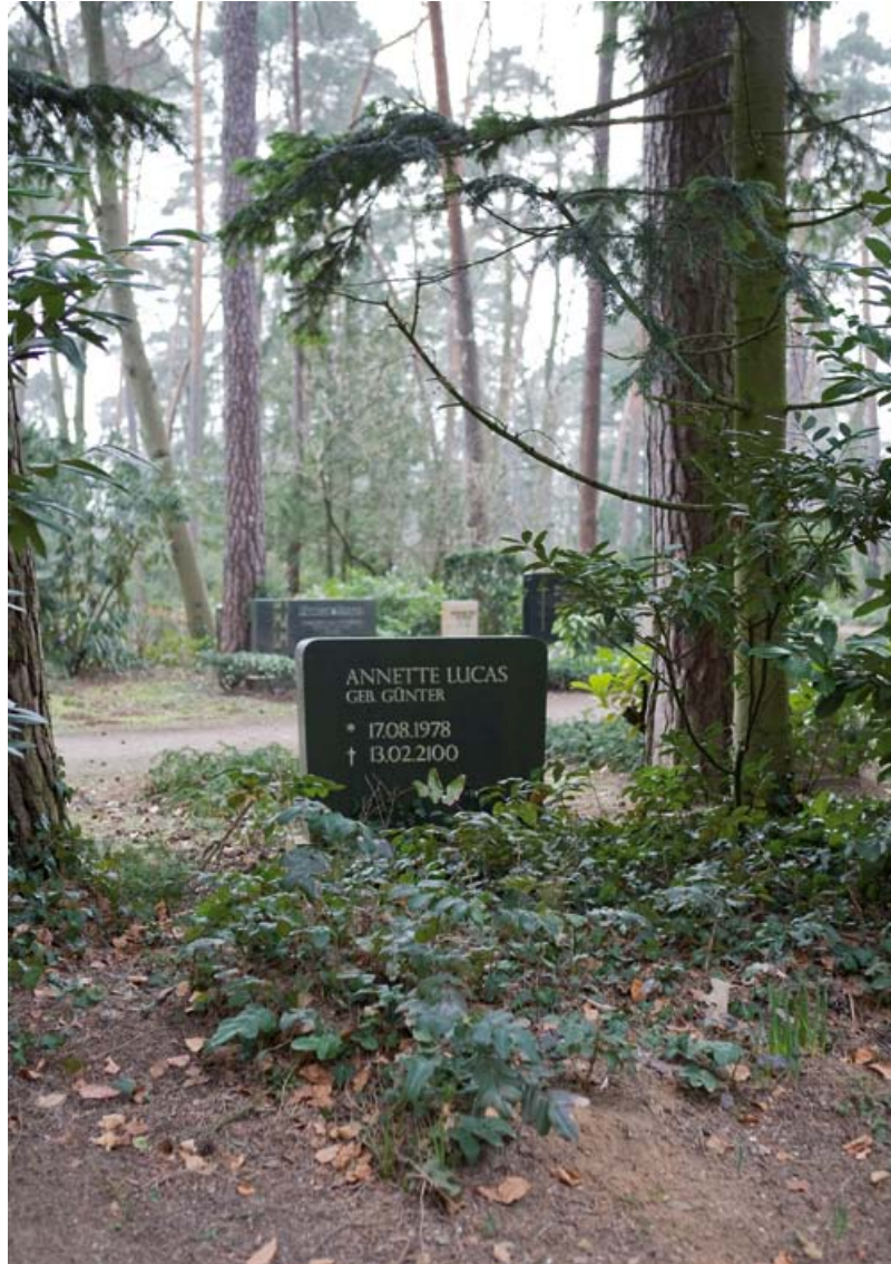
Annette Günter Untitled, 2010