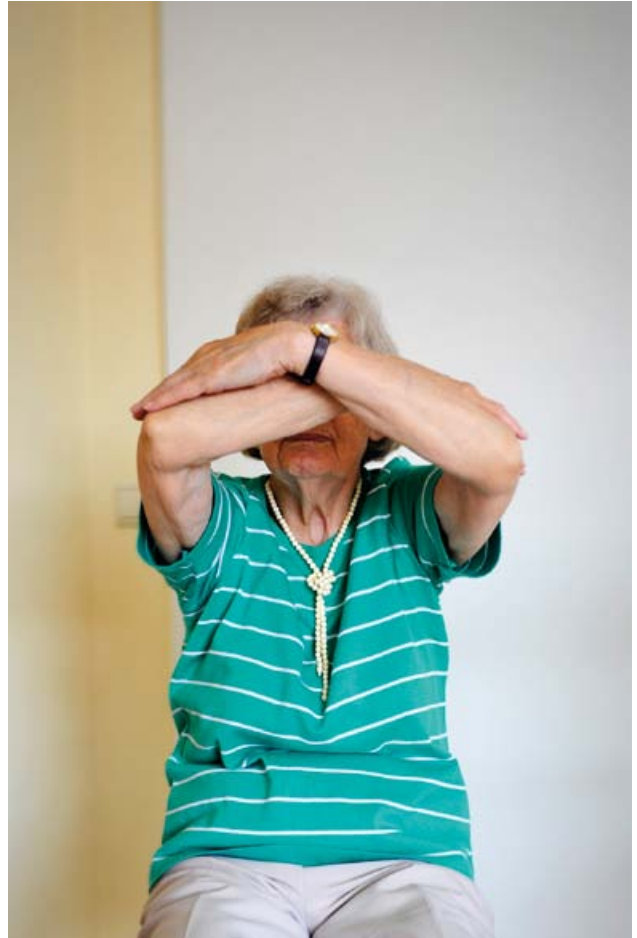
Joanna Nottebrock Untitled, from the series "In seniority", 2009