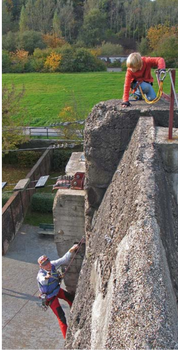
Horst Neuendorf Climbing with 8 and 80, 2008