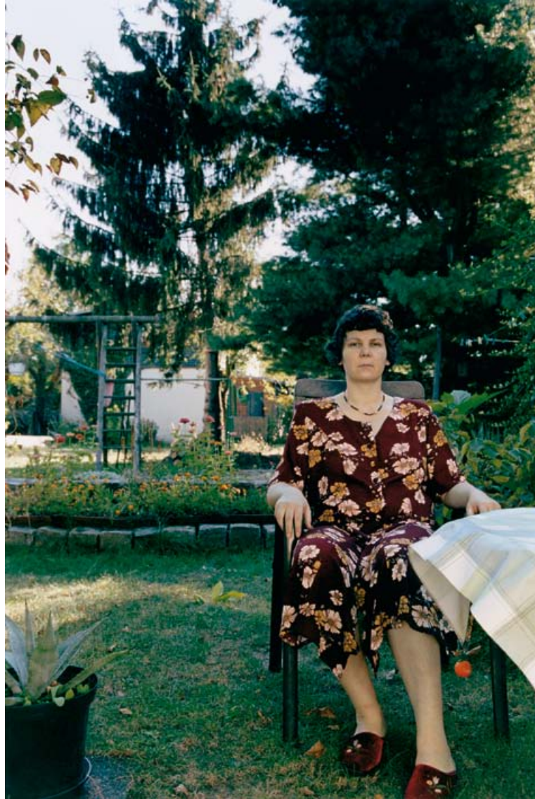
Daniela Risch Untitled, from the series "Helga", 2008, 3 rd place