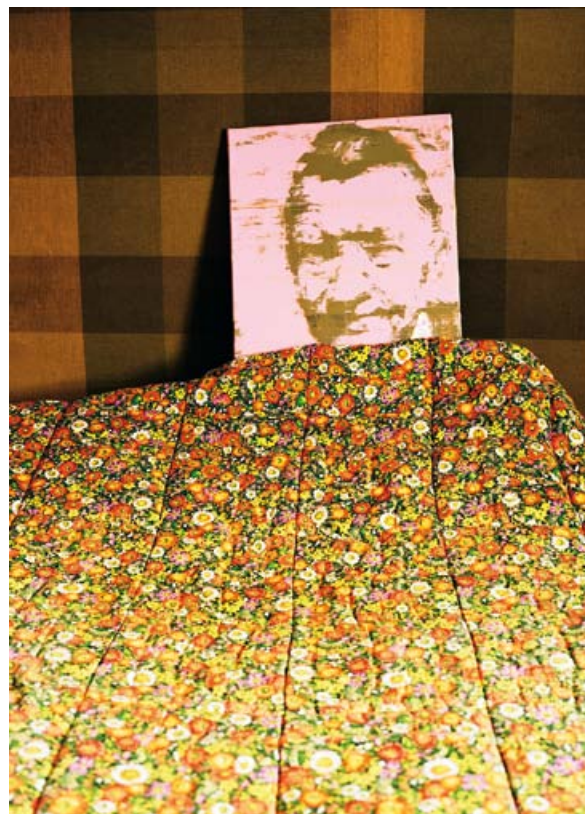
Simon Koy Grandpa 2, 2008