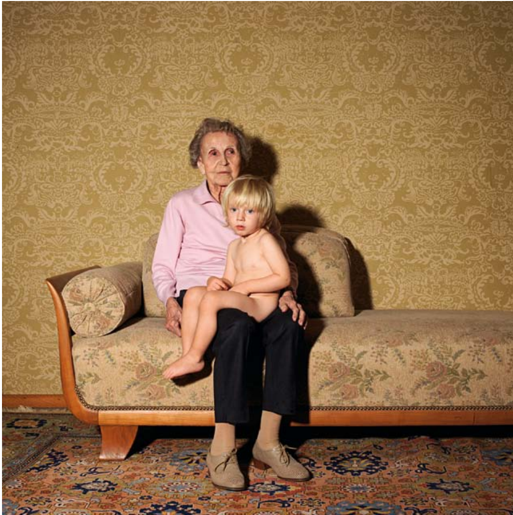
Great-grandmother and great-grandchild, 2010