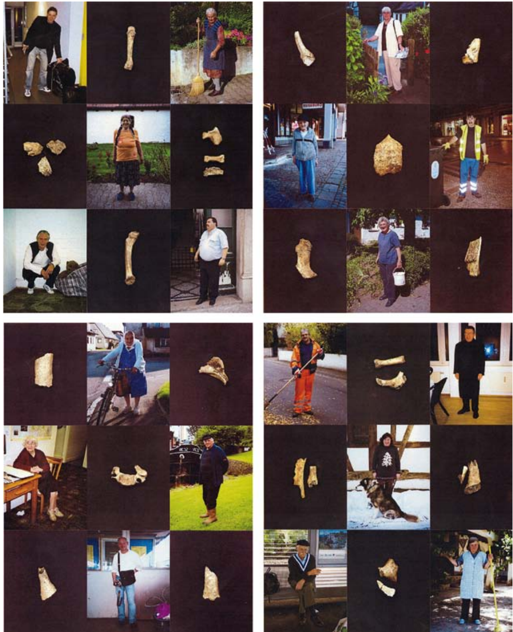
Ruth Knecht What remains?, 2009