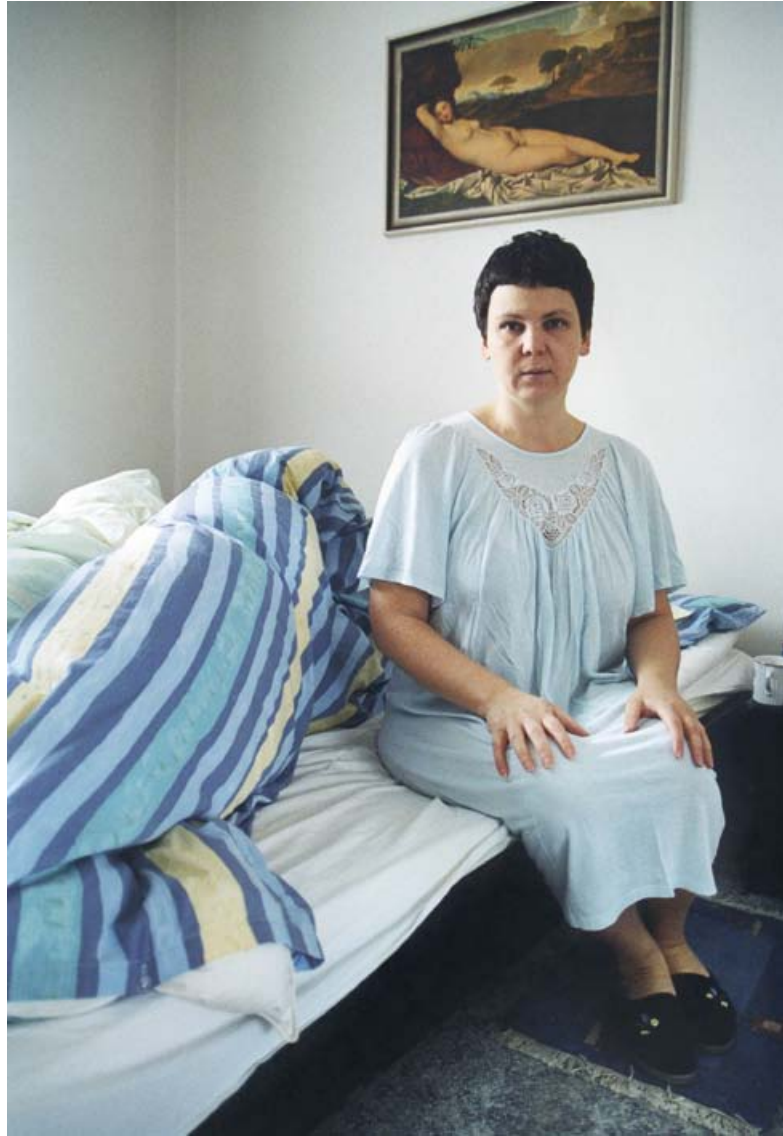
Daniela Risch Untitled, from the series "Helga", 2008, 3 rd place