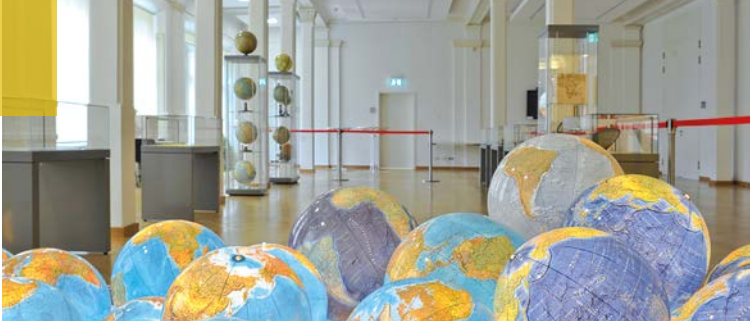
▲ In autumn 2013, the Centre for Science Studies staged an exhibition of globes that showed how our view of the Earth, the moon, and other planets has changed since the early modern age.