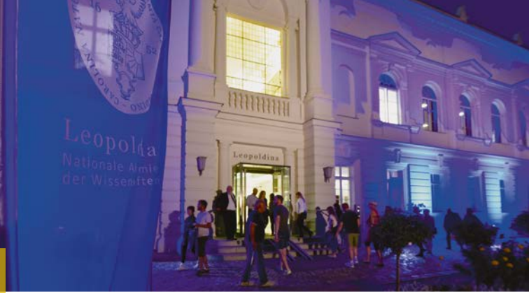
▲ At the Leopoldina Night 2018, visitors had the opportunity to experience a deep-sea lounge, a science slam, a scientific puppet show, and a commons debate.