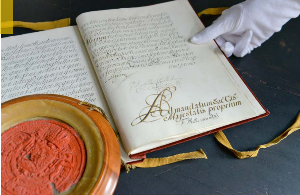
The charter with which Kaiser Leopold I awarded the academy special privileges in 1687 is made of bound parchment with red satin binding and an imperial seal.