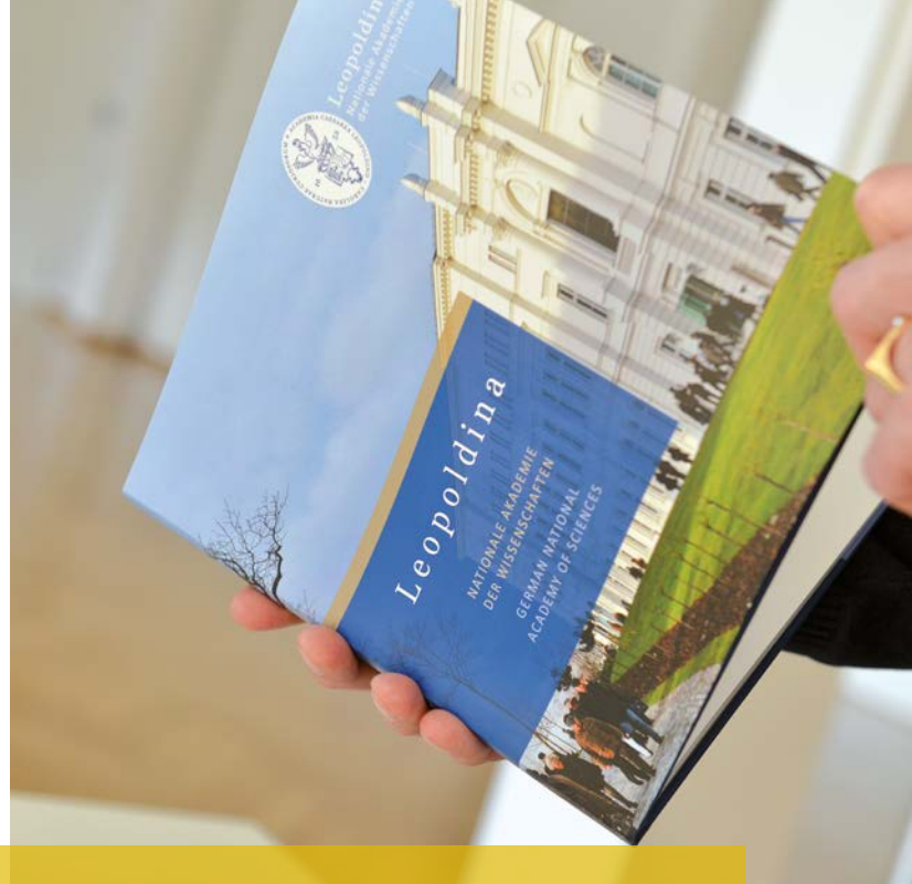
The Leopoldina's Illustrated Book provides a comprehensive overview of the National Academy.

Leopoldina publications are available in the digital library at: https://levana.leopoldina.org .