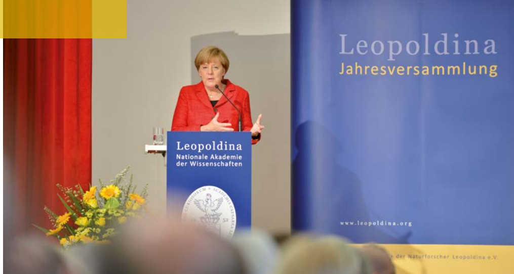
Chancellor Angela Merkel at the Annual Assembly 2015.