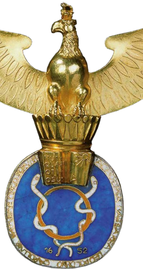
Leopoldina members and the city of Schweinfurt/ Germany donated this president's chain of office to the Academy in 1955.

The Academy is a registered non-profit association. It is financed by public funds from the Federal Ministry of Education and Research (80 %) and the state of Saxony-Anhalt (20 %), where its main office is located. The Executive Board is comprised of the President and four Vice Presidents. The Presidium is additionally complemented by other members and bears responsibility for all Leopoldina's activities. A full-time Secretary General heads the office and is supported by the administration.