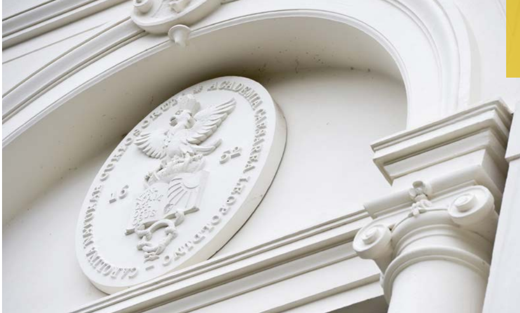
A relief of the Leopoldina emblem adorns the front door of the Academy building in Halle (Saale).